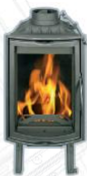
KV 025 F R