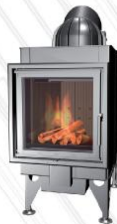
KV 025 G 01/02