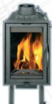
KV 025 F