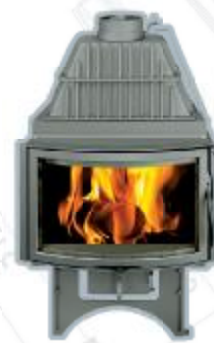
KV 025 M