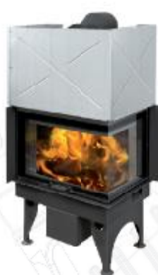
KV 055 R