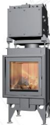
KV 025 N 01/02/03