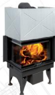
KV 055 L