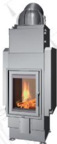
KV 075 W