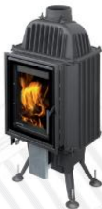
KV 075 01/02