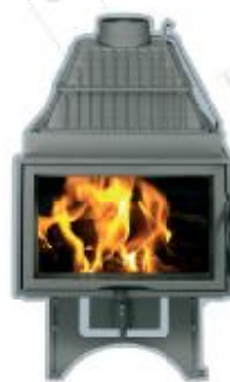
KV 025 L