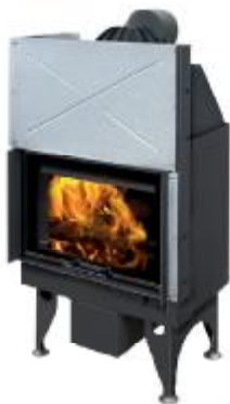
KV 055 B