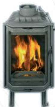
KV 025 F P