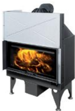
KV 055 A